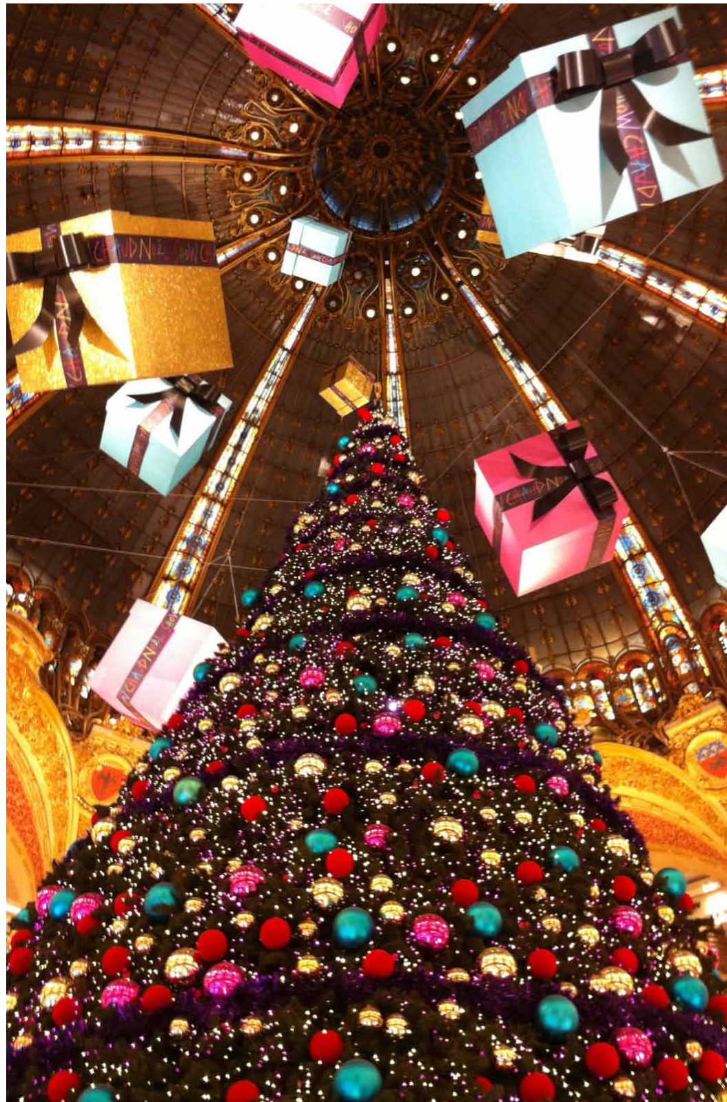
Galleries Lafayette; Paris, France — they have the most amazing tree